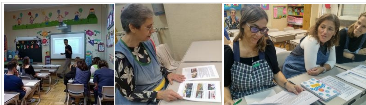
Fig. 1 – Workshop on Pilot LIBERTEC Guidelines contents.

Generally, educators welcome this projet guidelines for having some guidance on choosing technologies. Most of them don't really know the European Framework for digital competence of educators: DigCompEdu 1 .